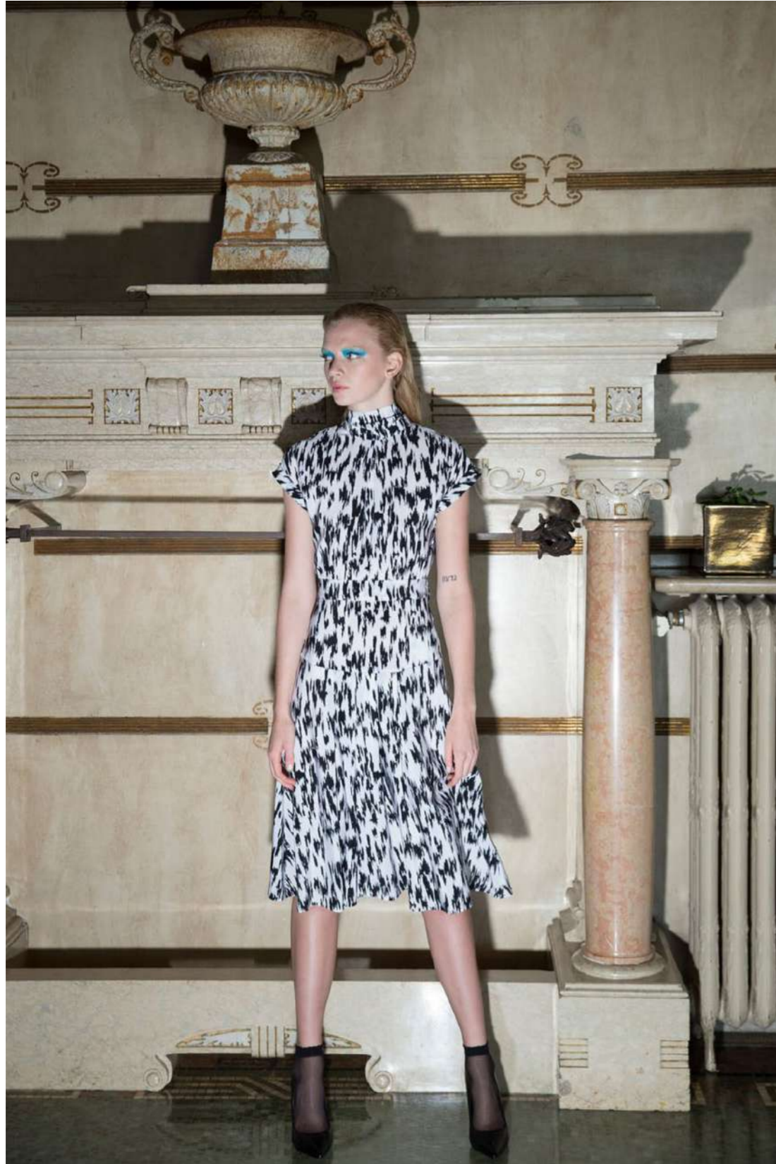
TRIGÈRE SPRING SUMMER 2019